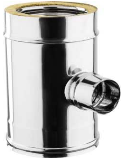
T 90° STACCO Ø80 MP