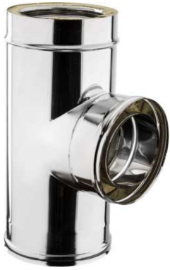
T 90° STACCO DP