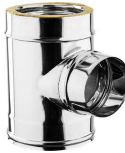
T 90° STACCO MP