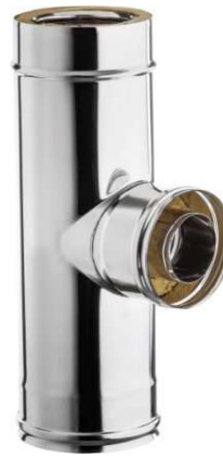
T 90° STACO Ø80 DP