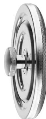
TAPPO PER COBUSTIBILI SOLIDI