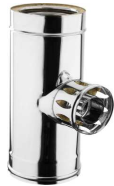
T 90° STACCO Ø80 COASSIALE