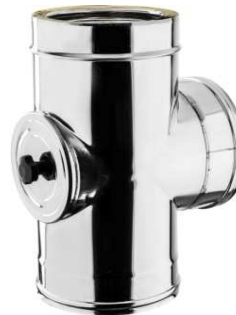
T 90° CON ISPEZIONE