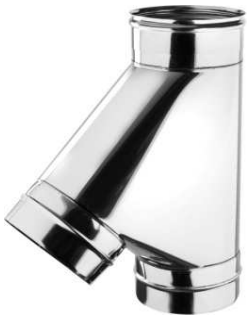
RACCORDO A 135°