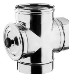
DOPPIO RACC. A T 90° + ISP.