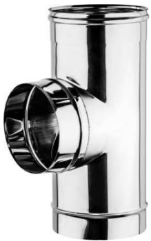
RACCORDO A T 90° MASCHIO