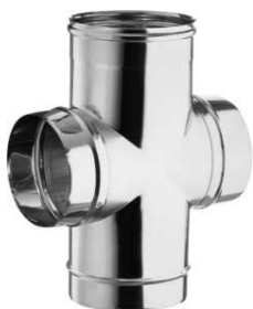
DOPPIO RACC. A T 90° M/M