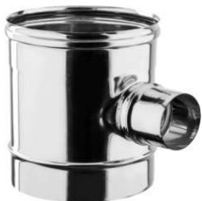
RACC. A T 90° Ø80 MASCHIO