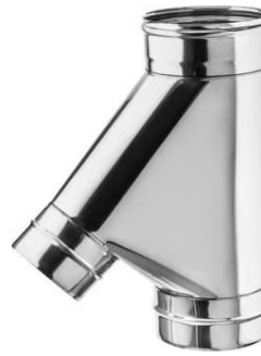
RACCORDO A 135° RIDOTTO