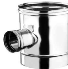
RACC. A T 90° Ø80 FEMMINA