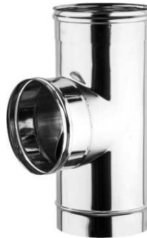
RACCORDO A T 90° FEMMINA